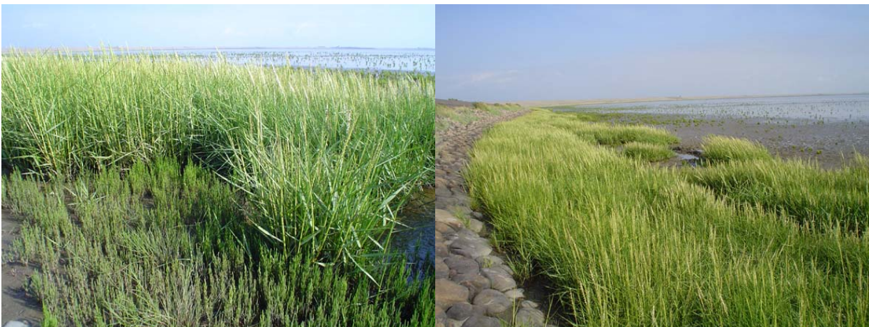
Fig. 1. Spartina anglica (at the back) displaces i.a. the native glass-wort Salicornia stricta (in the foreground): Wadden Sea of Schleswig-Holstein near Eider estuary, Germany, August 2004, photo by Stefan Nehring. Fig. 2. Spartina anglica sward: Wadden Sea of Schleswig-Holstein near Eider estuary, Germany, August 2004, photo by Stefan Nehring.

Common names: Common cord-grass, English cord-grass, rice grass, salt marsh-grass (GB), Vadegræs, Hybrid-Vadegræs (only for the sterile hybrid) (DK), Englisches Schlickgras, Reisgras, Salz-Schlickgras (DE), Engels Slijkgras (NL), Marsk-gräs (SE), englanninmarskiheinä (FI)