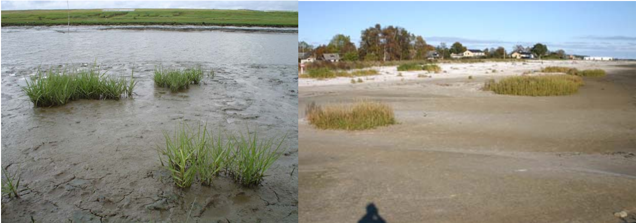
Fig. 3. Spartina anglica seedlings: Elbe estuary, Germany, August 2004. Fig. 4. Spartina anglica clumps on a sandy beach in a recreation area: Udbyhøj, Randers Fjord, Denmark, October 2005.